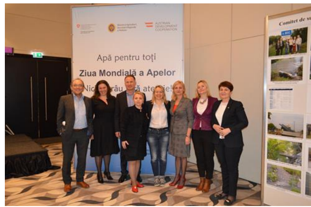
Water Day Conference, 22 nd of March, 2019, Chisinau.

Most of the projects that have been approved for presentation were related to the improvement of the municipal wastewater treatment systems. At the same time, it was decided to present the activities undertaken by Sub-basin Committees which have been active for several years already (for Bic, Raut and Larga rivers) in order to motivate the newly created committees to be active and implement activities which would strengthen cooperation between various target groups and local level and start solve ste-by-step the problems which affect the quality and quantity of water in rivers.