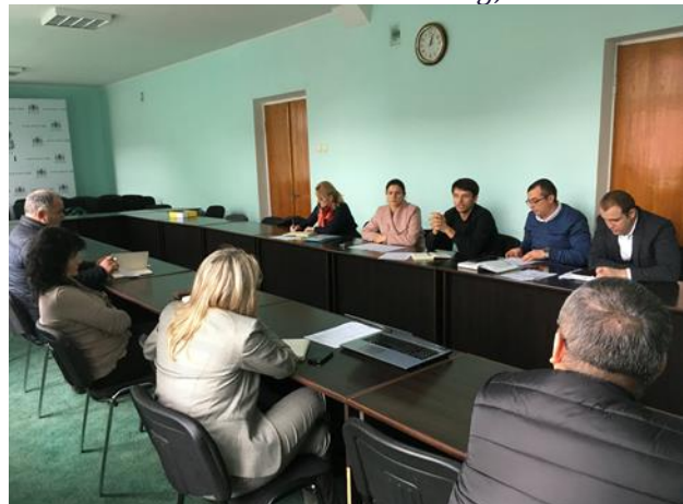
Raut Sub- Basin Committee meeting, Balti, 18.12.19.