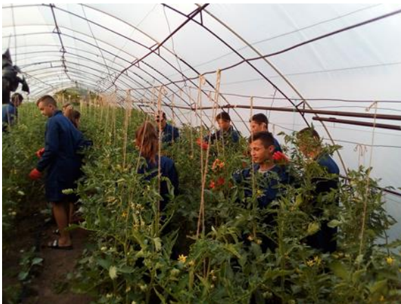
Pupils from Oxentia gymnasium school working in greenhouse