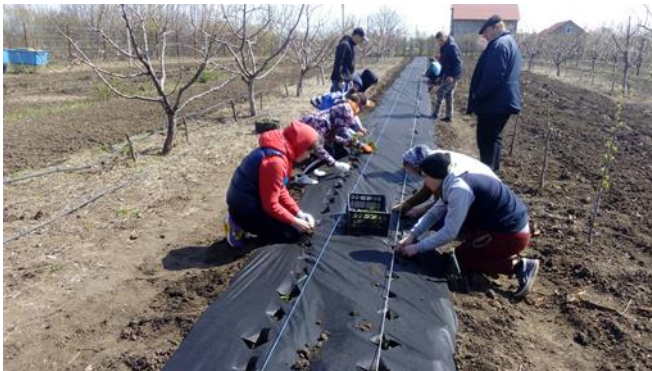
Field work of the students from Taul College, spring 2019

Autumn is the period when after the harvest of the fruit, the processing of the land, educational activities take place in which the young people develop skills and competences.