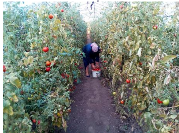
It's harvest time! (Oxentia gymnasium)