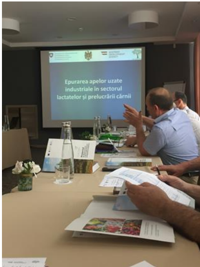
Wastewater treatment training in the dairy sector and meat processing, May 29 th 2019.