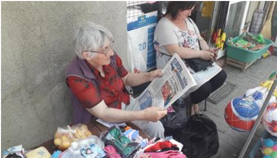
Stîrcea, Glodeni, 23.07.2019