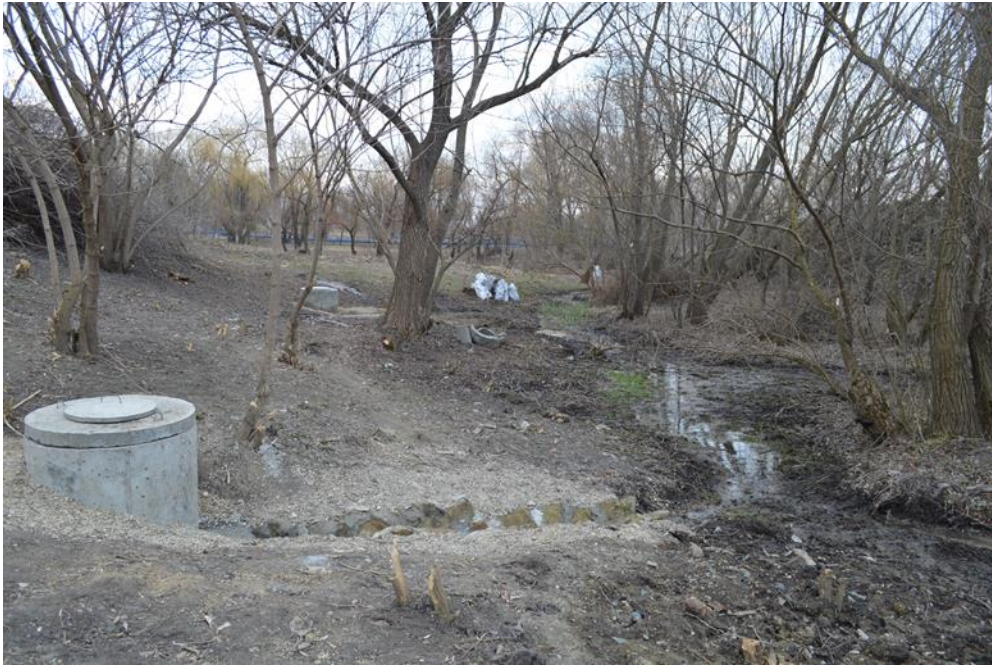
Spring arranged in Rediul Mare village, Donduseni district.

In order to increase the water flow in the Răut river, CNM cleaned from silt and arranged 5 springs from the village Rediul Mare, Donduseni district, the locality where Răut river originates from. There are several springs in that region, but most of them are clogged.