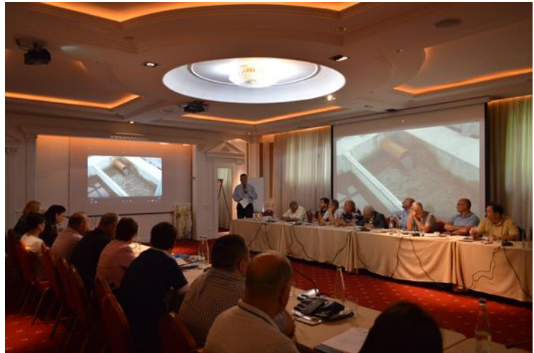
Wastewater treatment training in the wine sector, 31 st of May 2019.