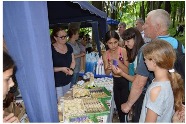
People learn about ecological detergents