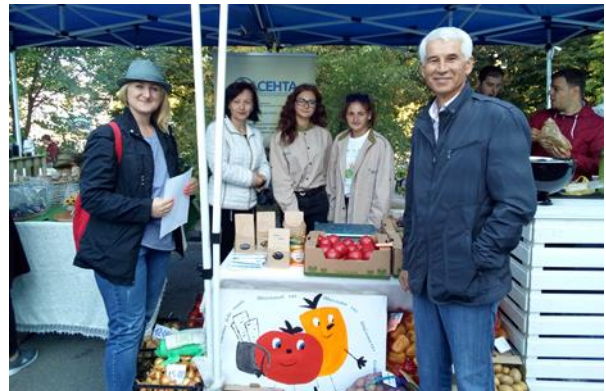
Partners from Taul College attending the IarmarEco open air Fair with their harvested crops