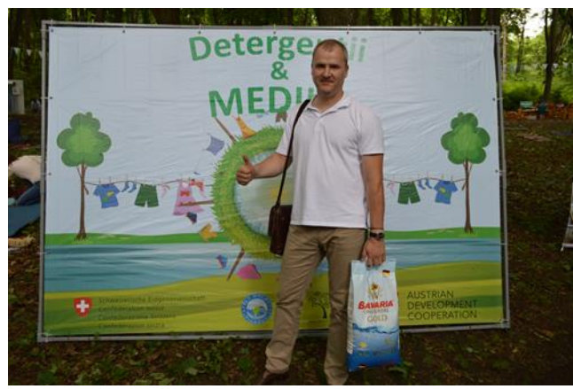
People attending the World Environment Day opt for more sustainable detergents

CNM participated in the event as the organizer of the ecological detergents' exhibition, attended by 13 economic entities and artisans who import, produce or sell ecological detergents, soaps and body care products on the market of the Republic of Moldova. The activity was organized in the framework of the campaign to promote the use of ecological detergents in the Republic of Moldova, which was launched by CNM in 2017. The aim of this campaign is to reduce the ecological pressure exerted on wastewater treatment plants which do not cope with the treatment of a large concentration of chemicals that are found in the today household and industrial consumption.