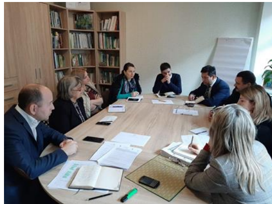
Bac Sub- Basin Committee meeting, 16.12.2019.