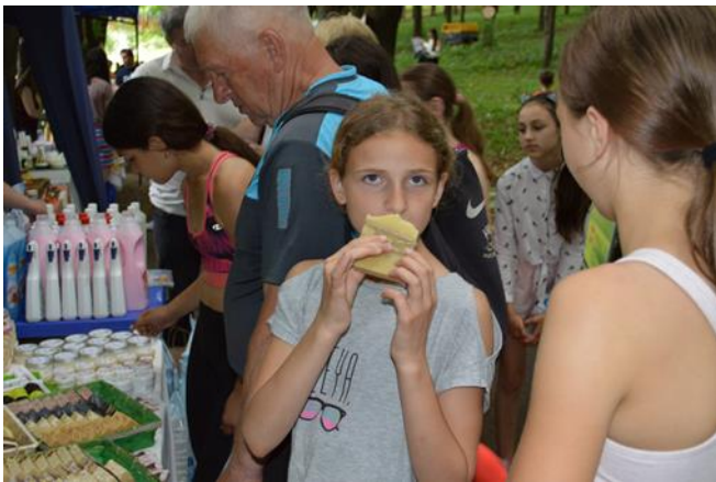
Children are also interested and lured by the delightful scent of handmade soaps