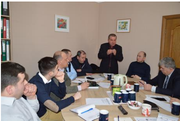
Tigheci Sub- Basin Committee meeting, 27.02.2019.

The National Environmental Center facilitated the creation of 6 sub-basin Committees for Bic, Raut, Ichel Rivers (tributaries of Dniester River) and Tigheci, Larga and Ciuhur rivers (tributaries of Prut River). CNM is the Technical Secretariat of Bic Basin Committee since 2012 and for Raut and Ichel rivers since 2018. According to the Regulation of operation of the Committee at least 2 meetings per year are organized for each of the created Committee. These operate according to the newly developed Law on Water of Moldova adopted in 2013, which was harmonized with the EU legislation on water. Hereby, minutes of each meeting of 6 created Committee are sent to the State Agency „Moldovan Waters”, a subordinated institution of the Ministry of Agriculture, Regional Development and Environment, responsible for integrated water resources management in the country.