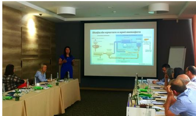
Wastewater treatment process presentation.

For the organization of events, CNM cooperated with the Embassy of Sweden in Moldova, Moldova Competitiveness Project, funded by USAID and AIDS (Sweden International Development Cooperation Agency) and "Livada Moldovei" Project funded by European Union (EU4Business Program) and European Investment Bank.