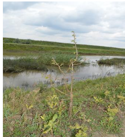
Growing up trees on the Raut banks, monitoring visit, June 2019.