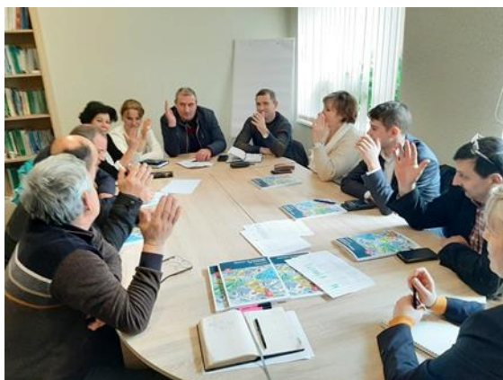
Larga Sub- Basin Committee meeting, 18.12.2019.