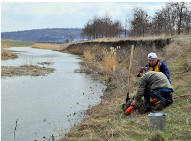
Planting campaign, March 29 th , 2019.

Planting activity of 1000 trees in Orhei town as a part of activity B.1. restoring shelter belts of Raut river on a segment between Mitoc village and Orhei town (earlier, within the project, 4100 trees have been planted on a distance of 4 km of the river banks, with the help of 300 volunteers). During spring 2019, planting activity involved around 100 volunteers from Orhei-Vit company, Gas Natural Fenosa and SEBN SRL. CNM already formed a strong track record of cooperating with economic entities on such activities and cleaning and planting campaigns. Taking into account that 2019 is a year of abundant precipitations, the majority of trees planted in autumn 2018 and spring 2019 took root and started to grow.