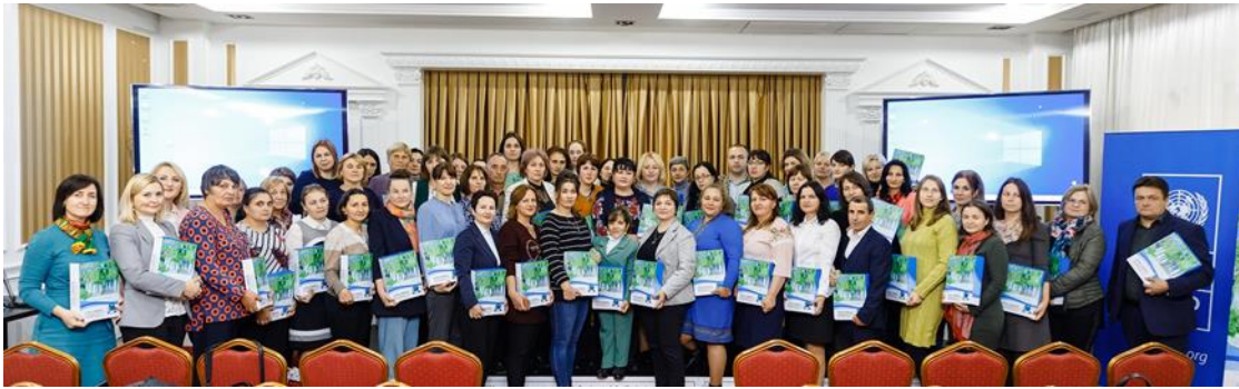
Participants at the "Climate Box" launch event on October 24 th , 2019 in Chisinau

The trained teachers shall use the Climate Box during classes, and the pupils shall know better climate change issues and have an appropriate behavior. The National Environment Center plans to train more teachers. So far, 200 copies of the publication have been printed and distributed.