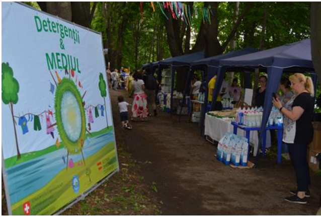
Detergents and environment Fair during the World Environment Day in Chisinau, June, 7 th , 2019